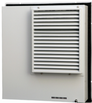
Option for out-door use: Cover (item number 219576)