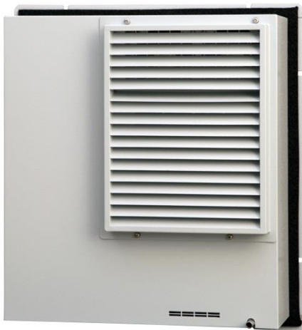
Option for out-door use: Cover (item number 219576)

Dantherm DC Air Conditioner 450 is widely installed in radio base stations, telecom cabinet & shelters, battery compartment/cabinets, and indoor/outdoor cabinets.